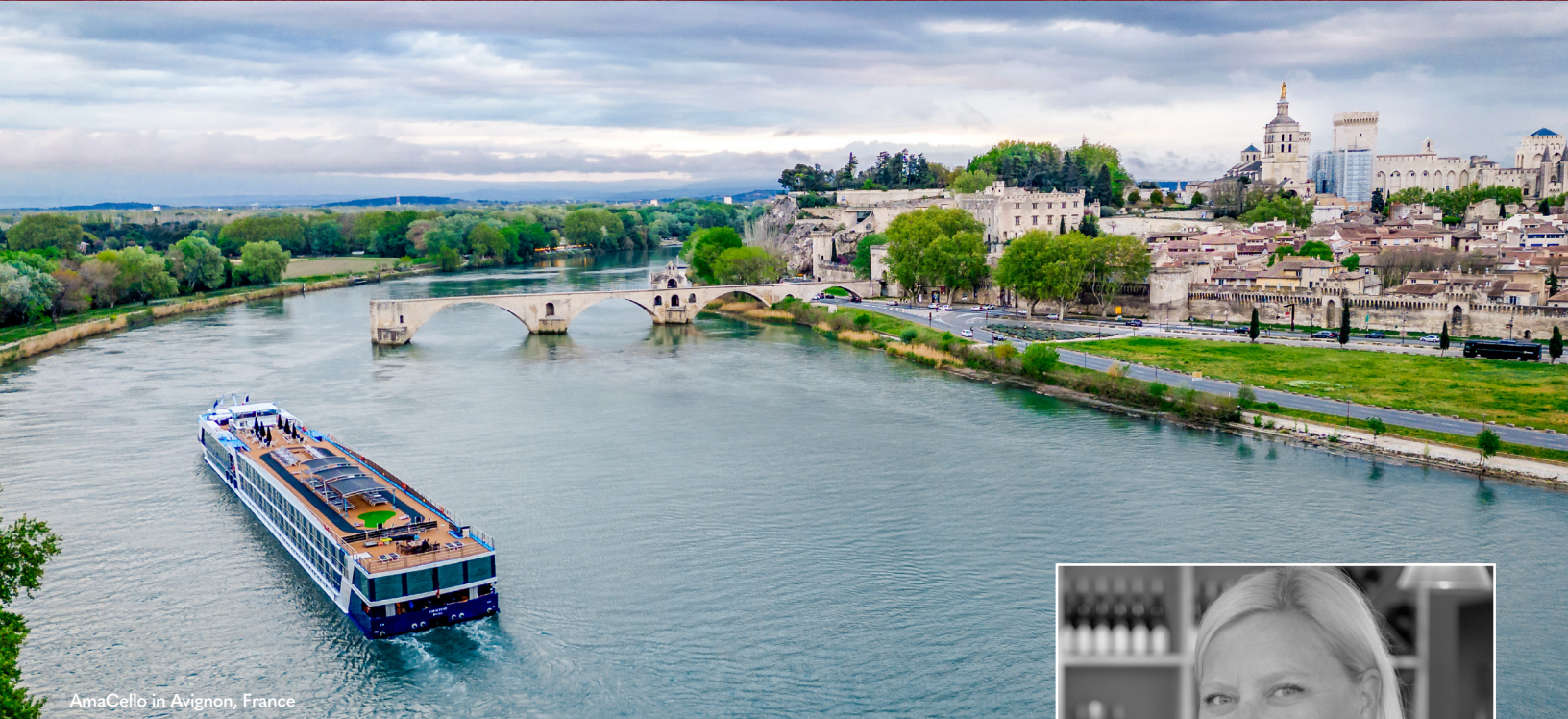
AmaCello in Avignon, France

UNCORK LOCAL TRADITIONS, SAVOR INTENSE FLAVORS AND ENJOY PALATE-PLEASEING ADVENTURES DURING AN AMAWATERWAYS WINE CRUISE