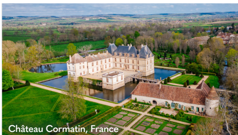
Château Cormatin, France

Indulge in French flavors on a palate-pleasing wine-themed itinerary that highlights the essence of France's Burgundy and Provence regions. Visit French châteaux from Burgundy to Provence, taste your way through the French culinary capital of Lyon and visit the Papal Palace in Avignon. Treat your palate to Mâconnais, Beaujolais and Chalonaise wines as you journey along the Rhône and Saône rivers. With a dedicated wine expert to guide you, you'll also have the opportunity to indulge in wine tastings and a specially curated food and wine pairing dinner on board. While you'll get more than a taste of Burgundy and Provence during this itinerary, the essence of these destinations will linger on your palate – and in your heart – for a lifetime!